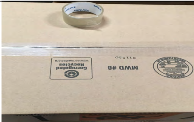
1: Tape the Bottom of the Box