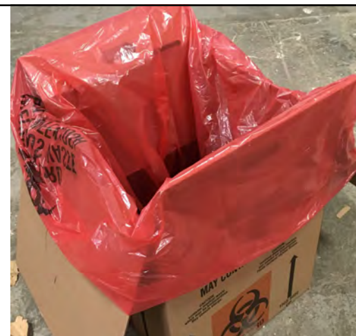
4. Box with Liner