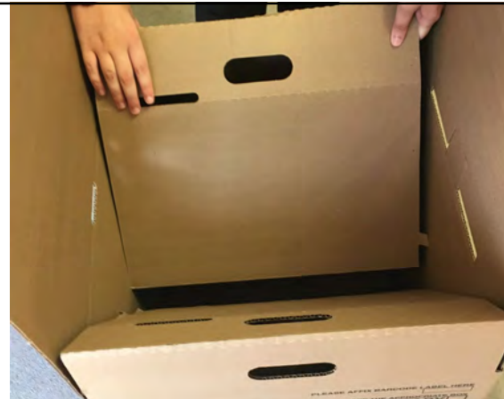
2. Create Handles